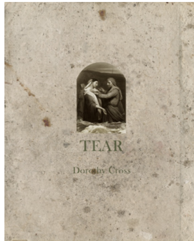
Tear , 2009 Box set of five prints Intaglio, 58 x 76.5cm Edition of 40

Tear is a limited box set of five intaglio prints with cover sheet by Dorothy Cross. The artist isolated small sections of an old engraving – a page from a bible found in her family home – and combined the detailed engraved lines with colour photographs of the sea taken near her home in Galway. The result is a remarkable series of poetic images from which parts of the body emerge through a skeletal topography of engraved lines and photographic stills of a restless ocean. Old and new technology combine and narrative and nature are momentarily stilled. Each image is hand printed on Moulin du Gue paper (58 x 76.5cm) and is numbered and signed by the artist in an edition of 40.