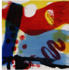
Summit Prayer Flags , 2004 Carborundum, 25 x 25cm Edition of 75