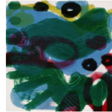
Soul of the Yellow Moth , 2004 Carborundum, 25 x 25cm Edition of 75