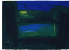
Bogland , 2007 Carborundum, 53 x 76cm Edition of 40