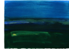
Bogland II , 2007 Carborundum, 53 x 76cm Edition of 40